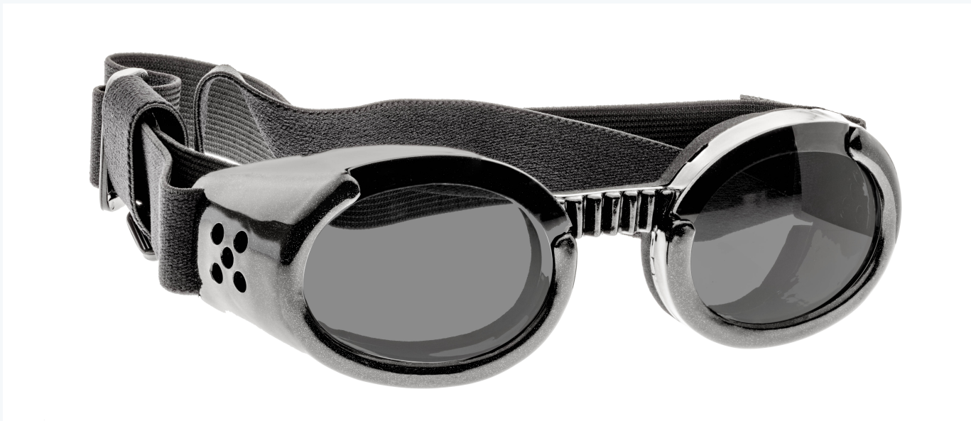
Large PetSpex frame pictured. The PSX filter is primarily used for therapeutic lasers in veterinary applications.